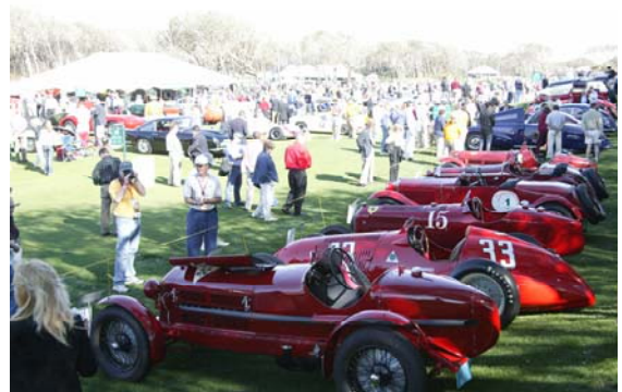
BELOW - A record crowd - estimated to be nearly 18,000 - views the Alfa display. Volunteers placed 280 cars along two fairways of The Golf Club of Amelia Island.