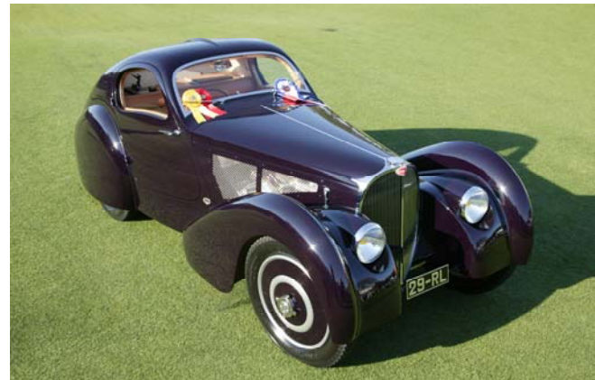
ABOVE – The Concours d'Elegance Award went to The Nethercutt Collection of Sylmar, California, for their spectacular 1931 Bugatti Type 51.

For the 2006 Amelia Island Concours d'Elegance, there were two Best in Show awards. In addition to the traditional Concours d'Elegance award, a second Best In Show was introduced to honor the top sports car or sports racer. Called the "Concours de Sport," it will now be a permanent part of the Amelia. Congratulations to The Nethercutt Collection and The Collier Collection.