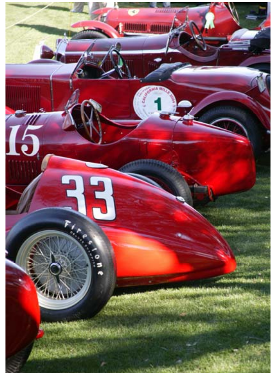
ABOVE - Nearly 50 sun-baked Alfa Romeos lined up for the 10 th Amelia Island Concours d'Elegance.