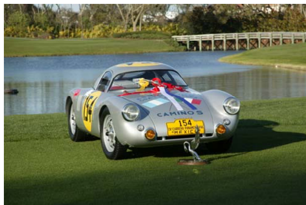
LEFT – The Collier Collection from Naples, Florida, took home the inaugural Concours de Sport Award for their ultra-rare 1953 Porsche 550 Coupe.